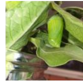
Cocoon starts to crack. Soon the butterfly

This term we started learning about 3D Shapes. We are currently in the 'Exploring' phase of our learning and have been building our own 3D shapes using a range of materials. We have loved bringing our learning outside, building our own 3D shapes and models out of natural materials.