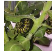
Caterpillar preparing to pupate