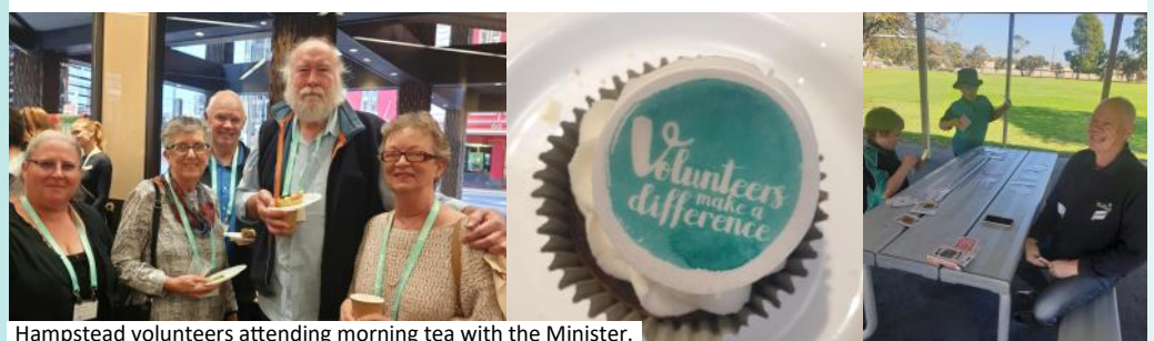
Hampstead volunteers attending morning tea with the Minister.